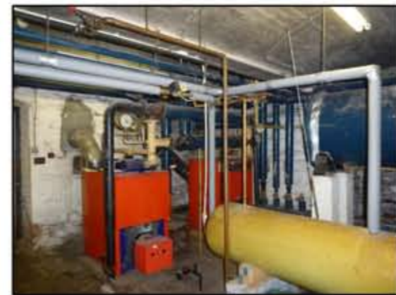
SHOWING BOILERS AND CALORIFIERS TO BE REMOVED